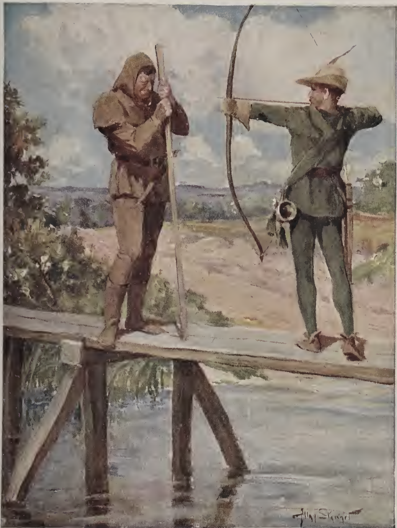
ROBIN HOOD AIMED THE SHAFT FULL AT LITTLE JOHN.